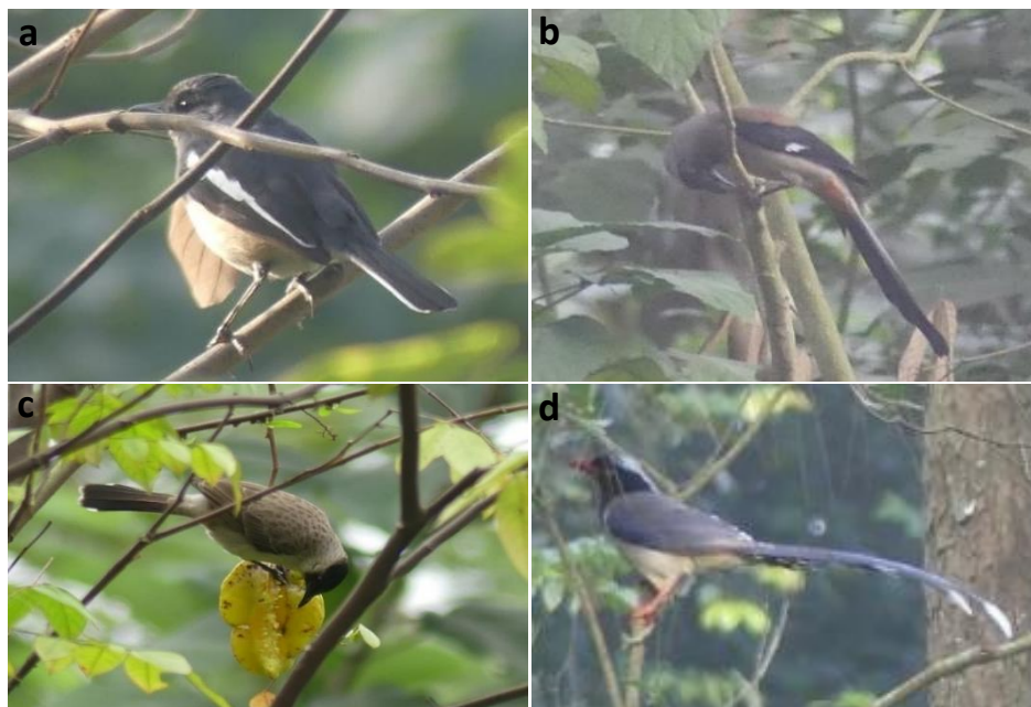
Figure 2. Representative animal species on the ecotourism route: (a) Oriental Magpie-Robin ( Copsychus saularis ); (b) Gray Treepie ( Dendrocitta formosae ); (c) Red-vented Bulbul ( Pycnonotus cafer ); (d) Yellow-billed Blue Magpie ( Urocissa flavirostris )