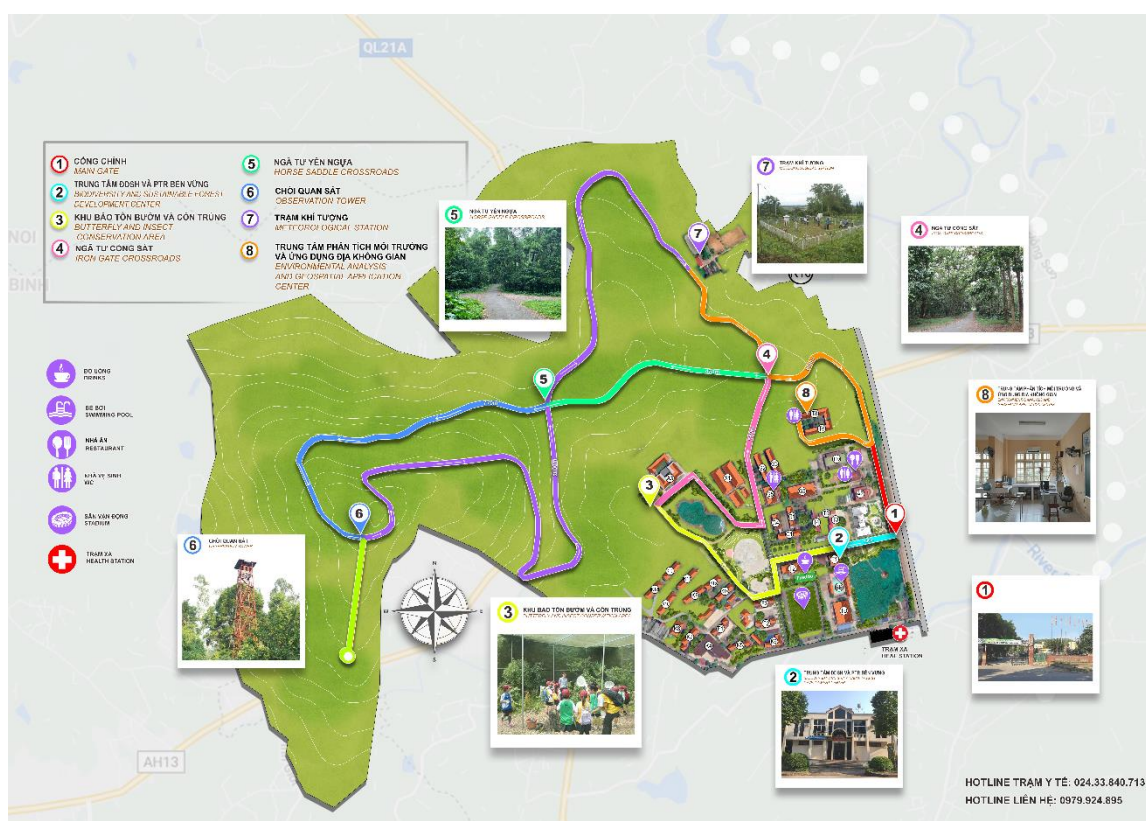
Figure 4. Map of proposed ecotourism route at the VNUF